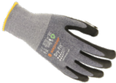
DRY-FIT® AIRFLOW/LIGHT GRIP 100213