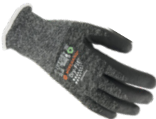
DRY-FIT® AIRFLOW/COLD 300209