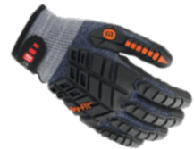
DRY-FIT® AIRFLOW/IMPACT 200220