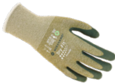
DRY-FIT® AIRFLOW/BIO 100219