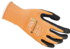
DRY-FIT® AIRFLOW/GRIP 100203