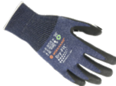
DRY-FIT® AIRFLOW/CUT C GRIP 100218