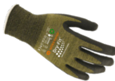
DRY-FIT® AIRFLOW/COLD WOOL 300252