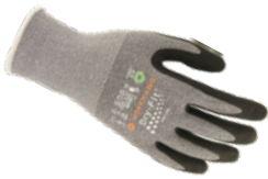
DRY-FIT® AIRFLOW 100209

Forget everything you know about precision gloves. The Dry-Fit® range is, in addition to being sustainable, the most flexible and comfortable gloves you have ever experienced!