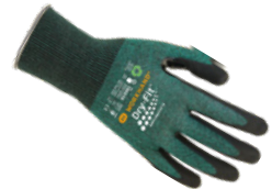
DRY-FIT® AIRFLOW/CUT B 100216