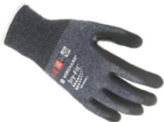
DRY-FIT® AIRFLOW/CUT C 100217