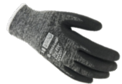
DRY-FIT® AIRFLOW/COLD WOOL WP 300210