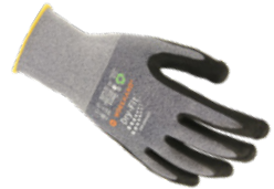
DRY-FIT® AIRFLOW/LIGHT 100212